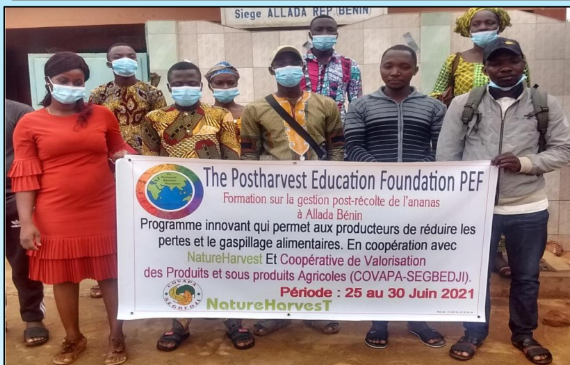
Participants of the training program