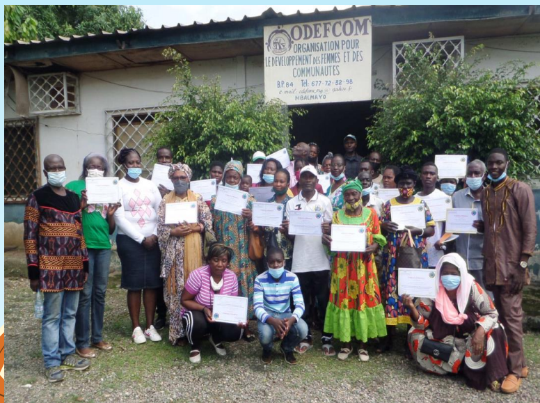
Participants of the training program