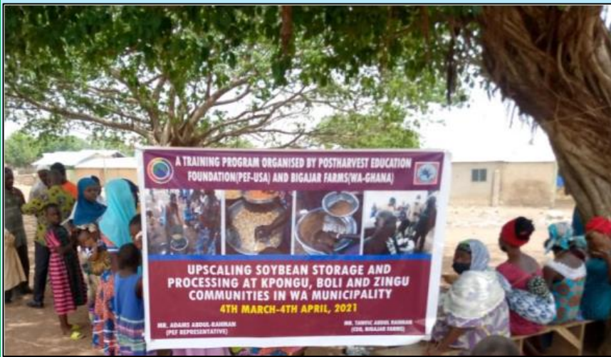
Training at Kpong community