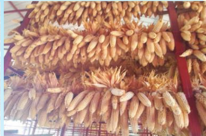
Hanging of maize cobs for primary drying

Robert Nshizirungu conducted training program on technologies and strategies to reduce postharvest losses and wastes in maize crop and vegetable crops in Gihinga vegetable market. For the report on training on Maize postharvest handling check: