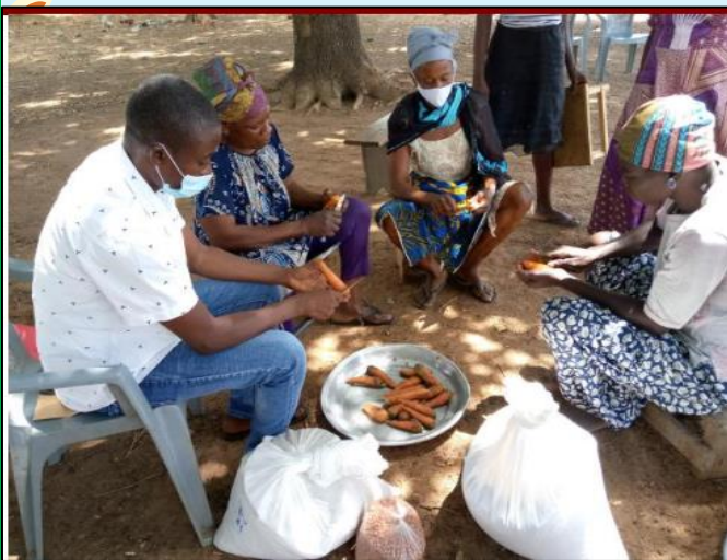
Carrot processing at Zingua community