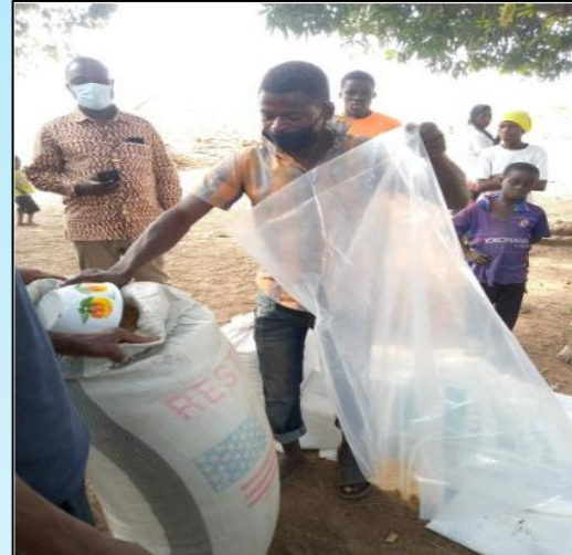
Demonstration of PICS bags