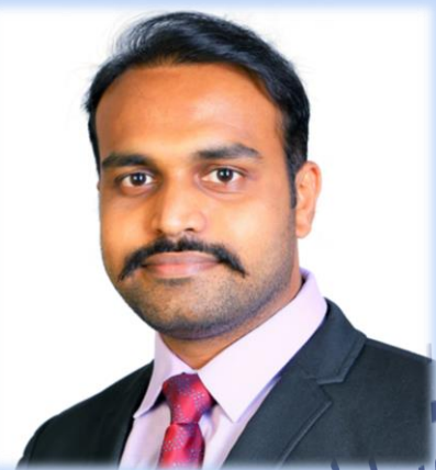
Dr. Vijay Yadav Tokala President

In 2023, we have witnessed many activities and events aimed at promoting postharvest practices and technologies to reduce losses. Recently, at COP28 in Dubai, speakers highlighted the importance of reducing food loss for climate benefits within the context of sustainable agrifood systems. "Walk-In Cold Rooms: A Practitioner's Technical Guide," one of the most comprehensive guides for designing and operating walk-in cold rooms, co-authored by PEF board members along with many other practitioners, was also launched at COP-28. As we look to 2024, we expect to maintain the same momentum and expand the outreach to reduce food losses.