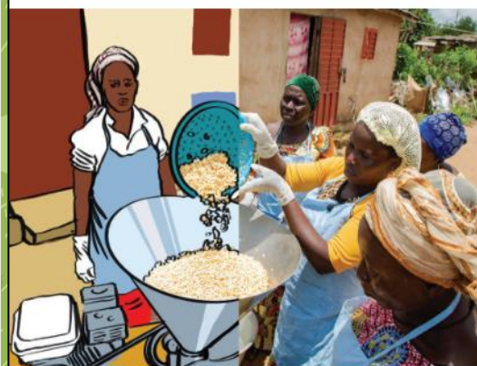
Food and Agriculture Organization of the United Nations Rome, 2024